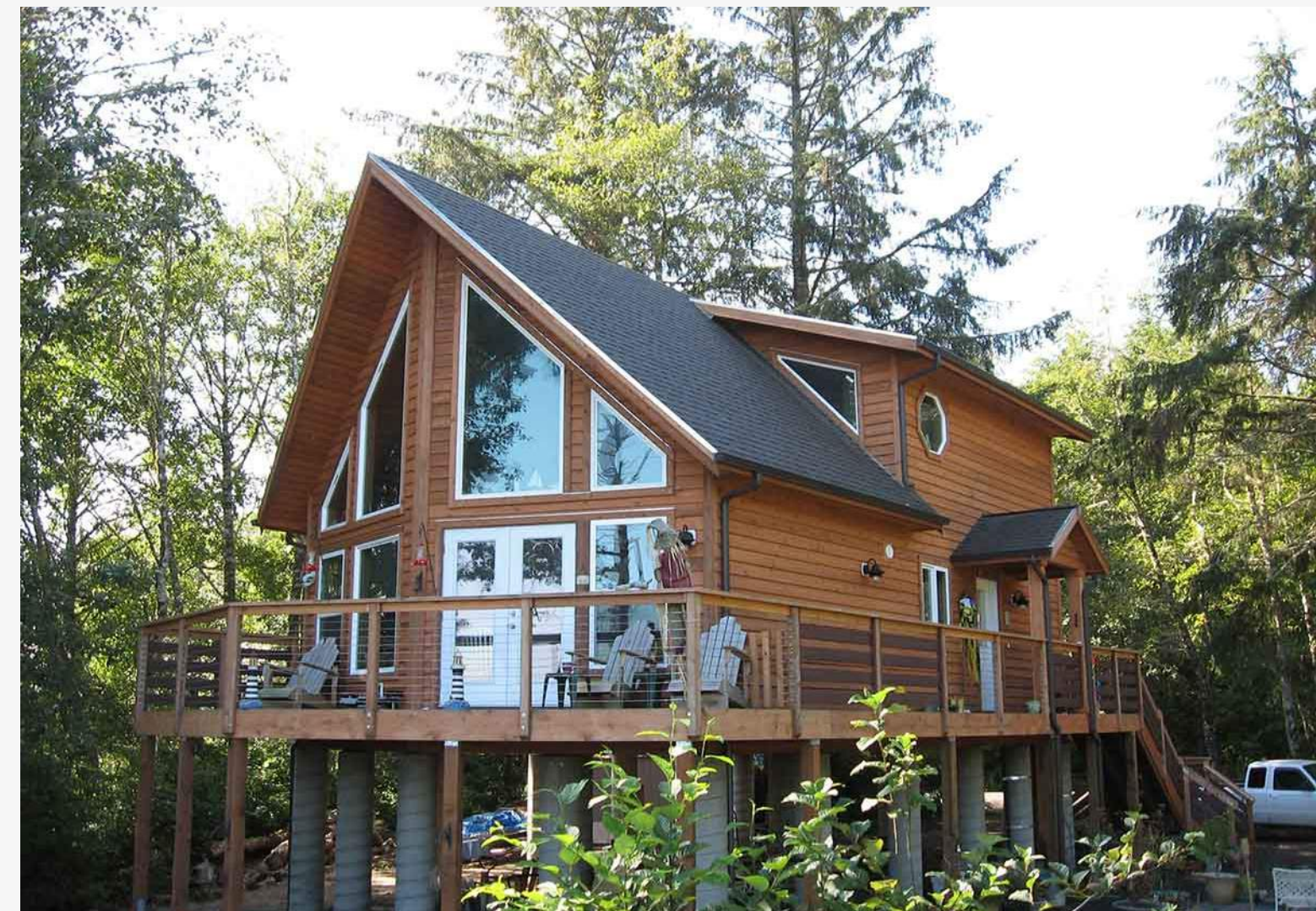
The 1,220-square-foot prow design home with vaulted ceilings and open loft area is an impressive open-concept custom home.