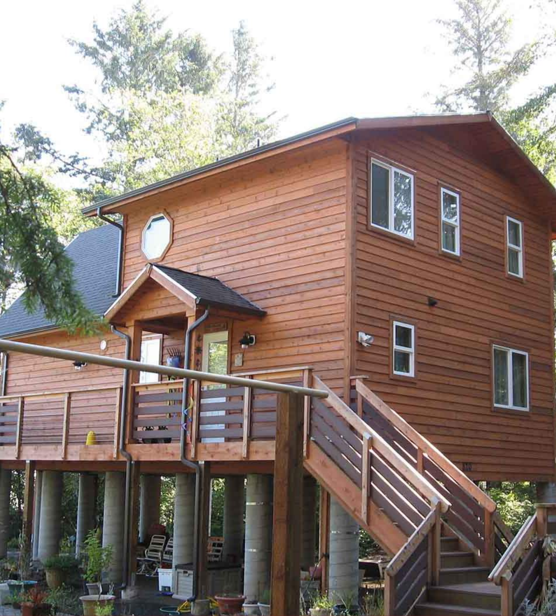
The two-story floor plan with three upper floor master bedroom provides the openness and privacy desired.

Kingsbury 1 - 2 Bed • 2 Bath Main Floor: 840 - Upper Floor: 380 Total Living Area: 1,220 Width: 22 - Depth: 45 Covered Entry / Porch: 35 Total Living: 1,220 - Total Area: 1,255